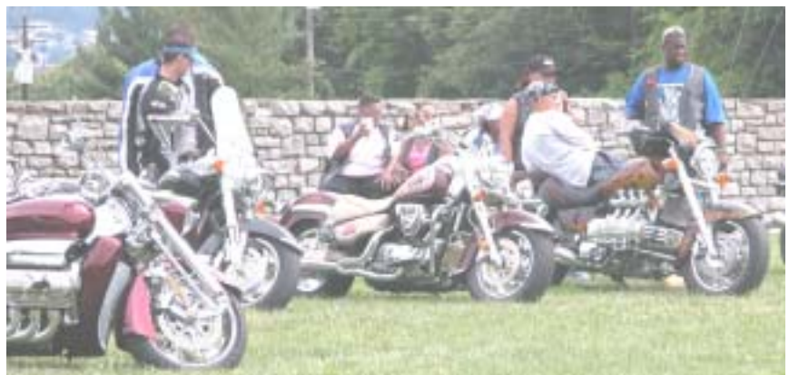
Something for everyone...including a long flank of gleaming cycles.