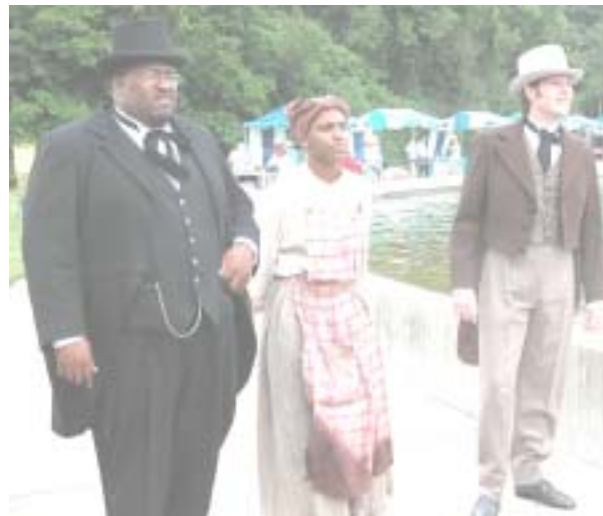
Several folks from the "old days" mingled with the crowd. The Underground RR Freedom Center provided two...and we were delighted when a few others joined them.