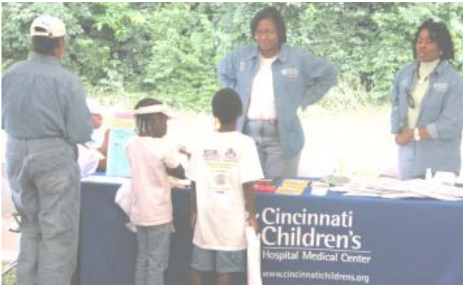
Free health information and check-ups drew folks to the health pavilion, staffed by volunteers from numerous health organizations.