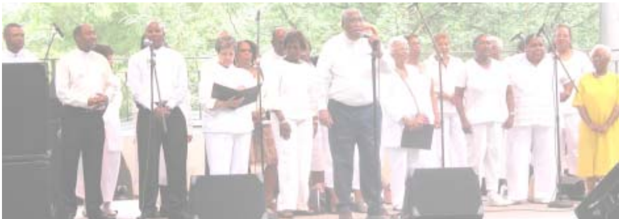
The Allen Temple Choir

Unfortunately, we did not get usable photos of several of the performers. We welcome any you have so we can add them to the scrapbook & share with others. Send to Juneteenth@fuse.net