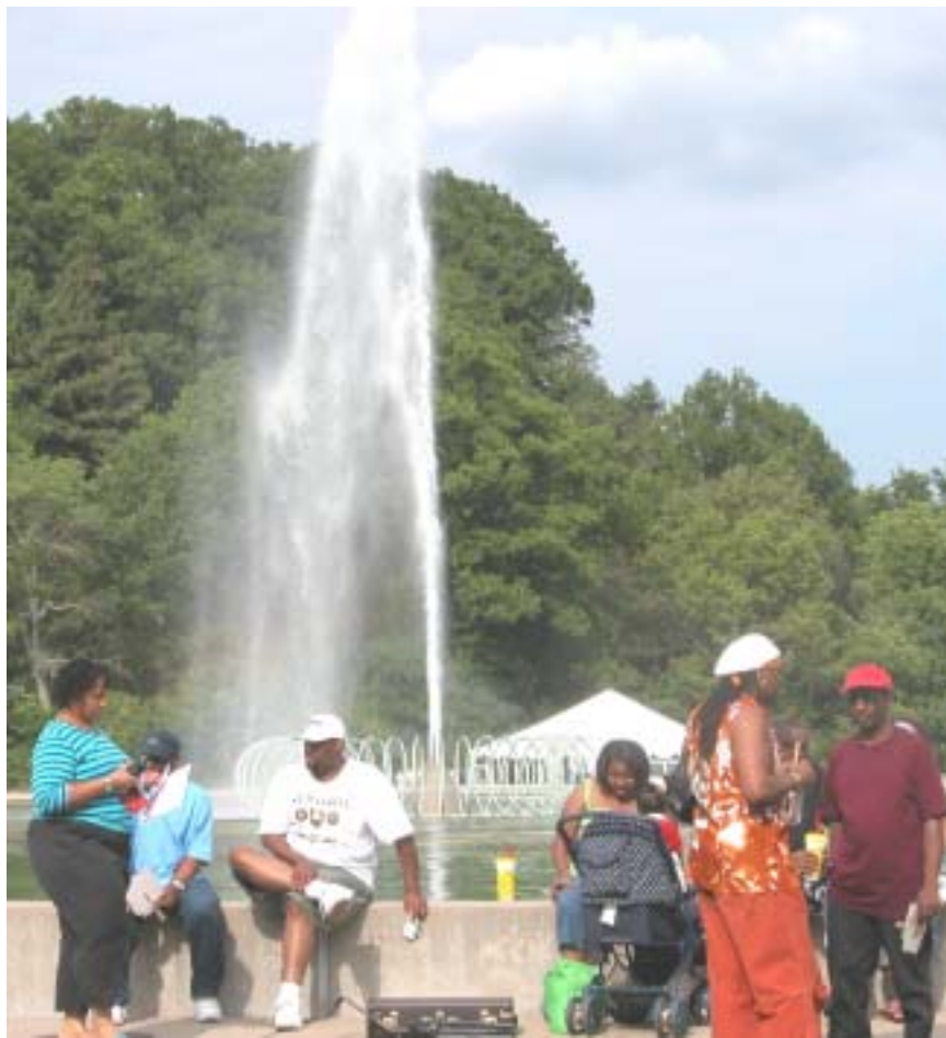
Scenes from the Cincinnati Juneteenth Festival June 18-19, 2005