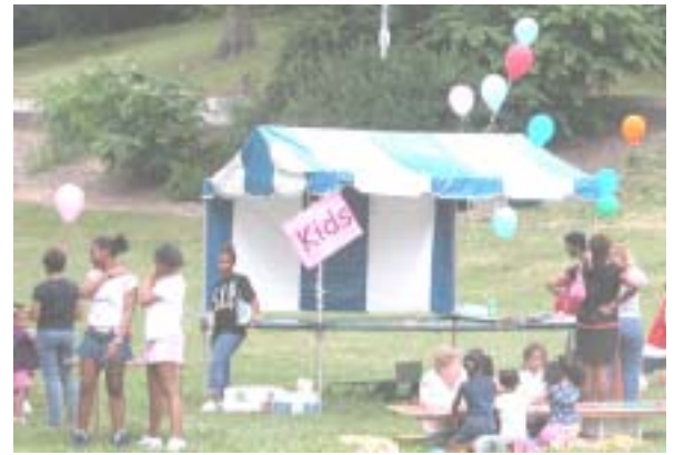
As always the Kids' area was very popular throughout Saturday afternoon.

Rockdale Baptist Church Choir Dunamis Sign & Mime Mighty Men of New Prospect Baptist Church Allen Temple Church Choirs Christ Temple Baptist Church Rhetorical Spirit of Praise Kenny Smith's Peace & Serenity Ministries The Word