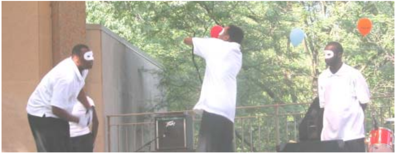
The Dunamis Mimes (from New Prospect Baptist Church) performed on both Saturday and Sunday.