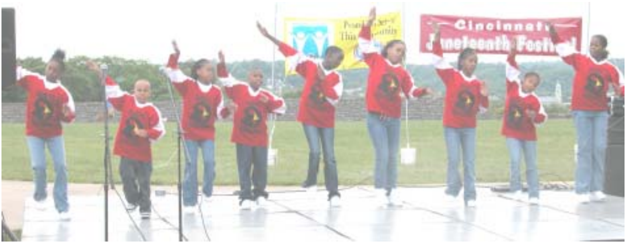
The W.E.B. Dubois Stompers were a real hit! And our camera just couldn't catch their best moves (such as the human jump rope!).