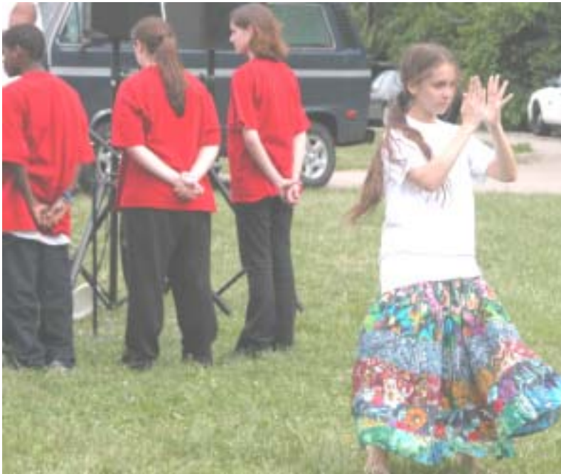
These young dancers call themselves “Blazing Hearts,” and they are with the Cincin-