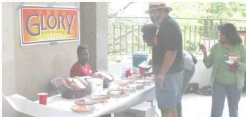
Glory Foods sponsored this year's Sweet Potato Pie Bake-off...and the judges tasted & compared 13 delicious pies...